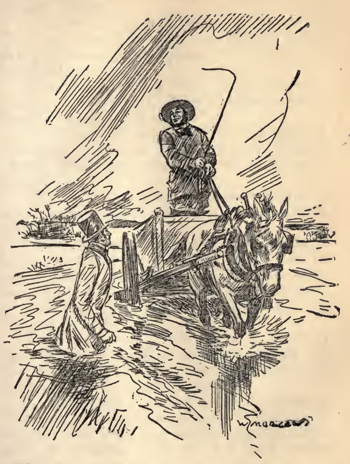
"'Say,' he cried, 'I'm cruisin' your way; better get aboard, hadn't you?'"